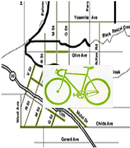
Building bike paths implementing bike plans