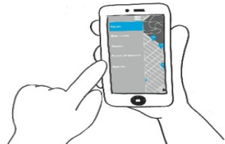
Traveler Information Systems that work w/ social media