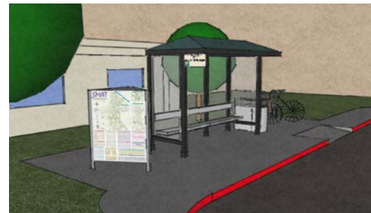
Bus stop improvements