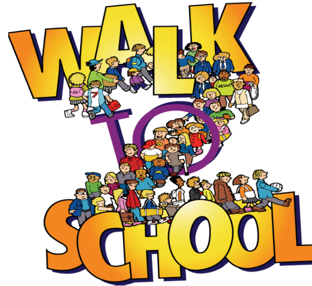
Educational safe routes to school programs