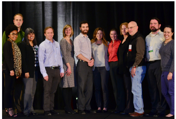
LGC Staff at the 14th Annual NPSG Conference