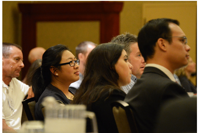
Participants at the Advancing Bicycling Workshop

http://www.mercedsunstar.com/living/liv-columns-blogs/article34982217.html