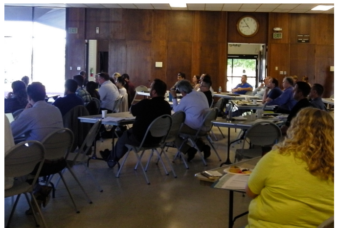
Participants at the LID Workshop