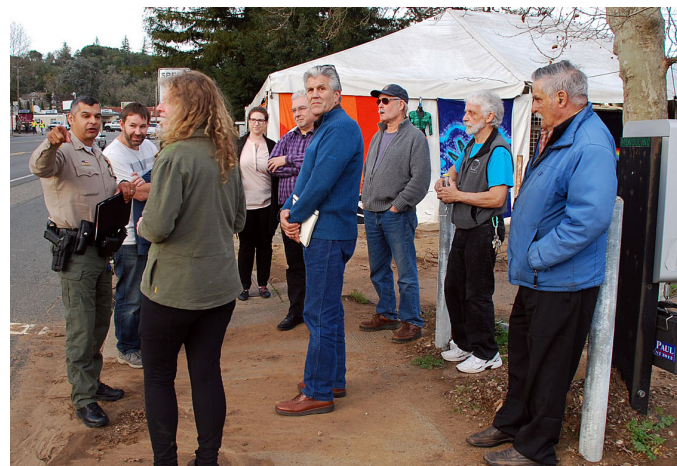
Attendees at the Hopland mini-charrette

LGC, partnering with the City, Contra Costa County Health Services, and a transportation consultant, organized and facilitated a walk and design workshop and community meetings to identify changes along the 2 mile Rumrill Boulevard that connects San Pablo from Contra Costa Community College to the Iron Triangle Neighborhood in Richmond. The community chose a lane reduction, or road diet, combined with the addition of protected bike lanes (“cycle tracks”) on both sides of the street. The Metropolitan Transportation Commission approved $4.3 million in Regional Active Transportation Program funding for construction of the first phase of the plan.