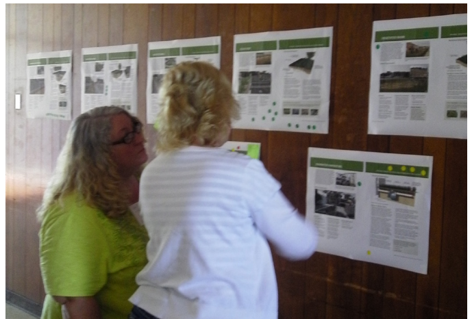
Participants at the LID Workshop