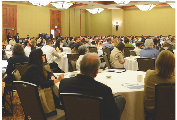
Attendees at the SEEC Forum