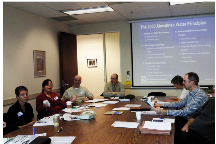
Regional teams update the Ahwahnee Principles Guide

LGC is actively assisting local jurisdictions to address the drought, growing uncertainty over water supplies due to climate change, challenges faced by disadvantaged communities and implementation of the Sustainable Groundwater Management Act. Staff continues to meet with state agencies (e.g., DWR, State Water Board, OPR, CalEPA) and participate in multiple advisory groups to explore funding and partnership opportunities, as well as to inform state-level policies that impact local governments. LGC has been active in the following discussions: urban greening messaging in the face of drought, the state’s updated model water efficient landscape ordinance (MWELO), drought impacts on public health, building partnerships to achieve the governor’s drought executive order requirements, water-energy nexus in the context of climate action, statewide impact of the Governor’s Water Action Plan, and implementing the Sustainable Groundwater Management Act (SGMA). LGC is a member of the SGMA Implementation NGO Advisory Committee and the Land-use committee of the California Economic Summit, and is under consideration for the California Roundtable on Water and Food Supply (CRWFS). Through these initiatives, staff are actively providing input to DWR on SGMA guidelines and regulations. LGC is