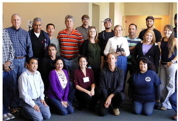
Participants at the Fresno QWEL Training