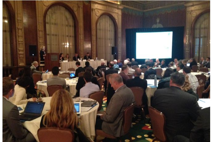
Attendees at the CCA Forum

Through the Local Government Sustainable Energy Coalition (LGSEC) LGC is providing local governments with expert analysis and leadership in the areas of energy efficiency, renewable energy, climate action, and community choice aggregation. In May, over 175 local government and other stakeholders from across California attended the LGSEC-organized Community Choice Aggregation Forum in Los Angeles. LGSEC is now working with the Center for Climate Protection to co-host the “Business of Local Energy Symposium” on March 4, 2016 in San Jose, CA. In 2015 LGC staff also supported a strategic planning process for LGSEC with Dig In Consultants which included restructuring and strengthening its current relationship with LGC. In this new relationship, LGSEC will function as a Coalition of the LGC and the entities will work together in an enhanced capacity to leverage each entity’s unique strengths and add value to the energy and climate field.