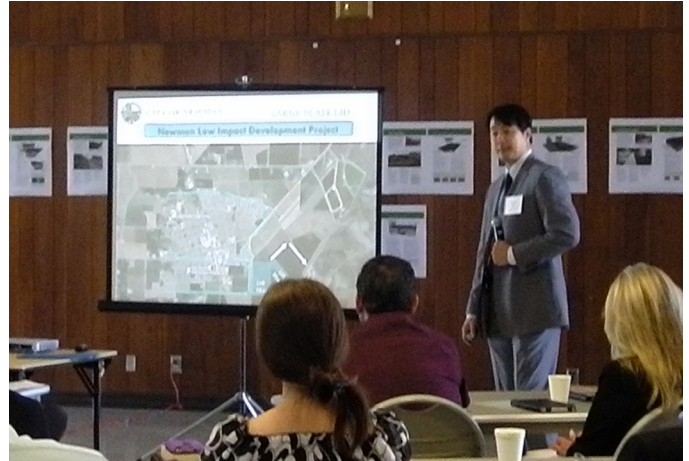
Participants at the LID Workshop

LGC, in partnership with a consultant and the City of Riverbank, completed the Lower Stanislaus LID Alternative Compliance Plan. This report identifies options for implementing a community-wide approach to low impact development (LID), as well as significant challenges that are still needing to be addressed. LGC hosted an LID workshop for the greater community, and presented the Final Plan to the City. We hope this report serves as a model and resource for other small communities trying to meet LID requirements while promoting infill development.