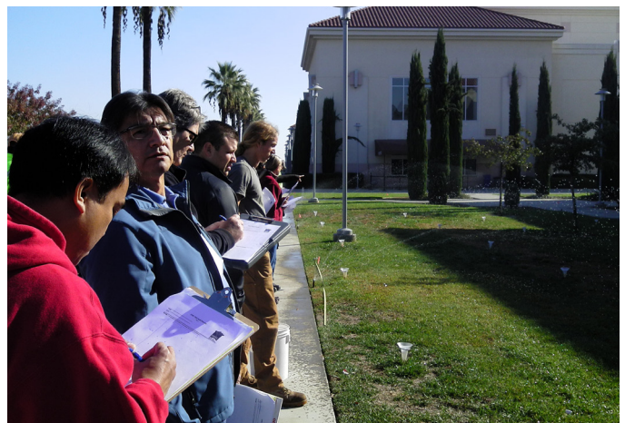
Participants at the Fresno QWEL Training