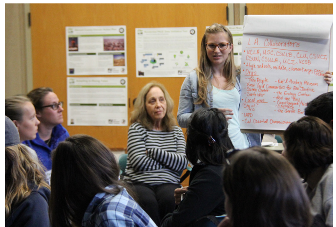
CivicSpark fellows in Los Angeles