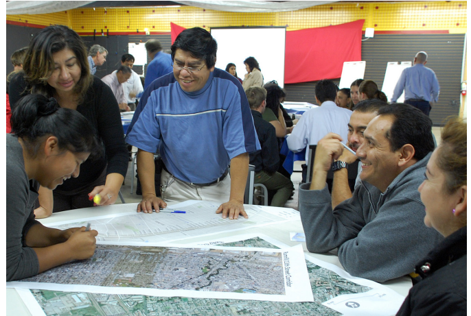
Residents at the San Pablo Workshop

LGC is part of a consultant team selected by the City of Sacramento to develop a complete streets plan for the Broadway corridor, a major commercial street and the southernmost edge of Downtown Sacramento. We assisted with an all-day mobile workshop and design meeting with stations at multiple locations to gather public input in the field. We also provided facilitation support at a workshop to review alternatives for a road diet and will assist with the final report. The plan will be taken to City Council in early 2016.