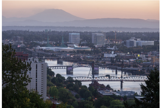
Portland, OR - the location of the 15th Annual NPSG Conference