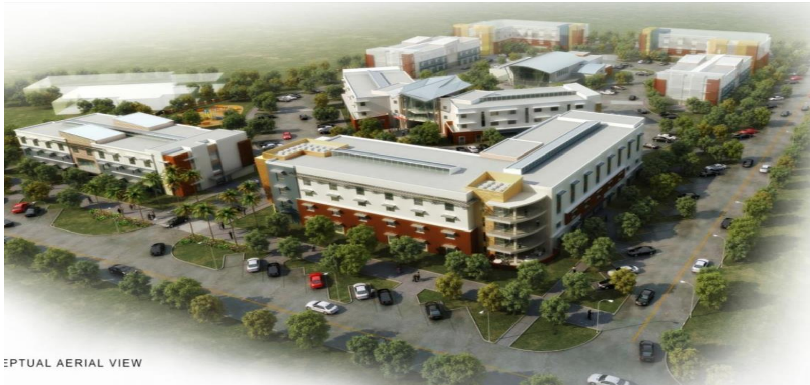
CONCEPTUAL AERIAL VIEW